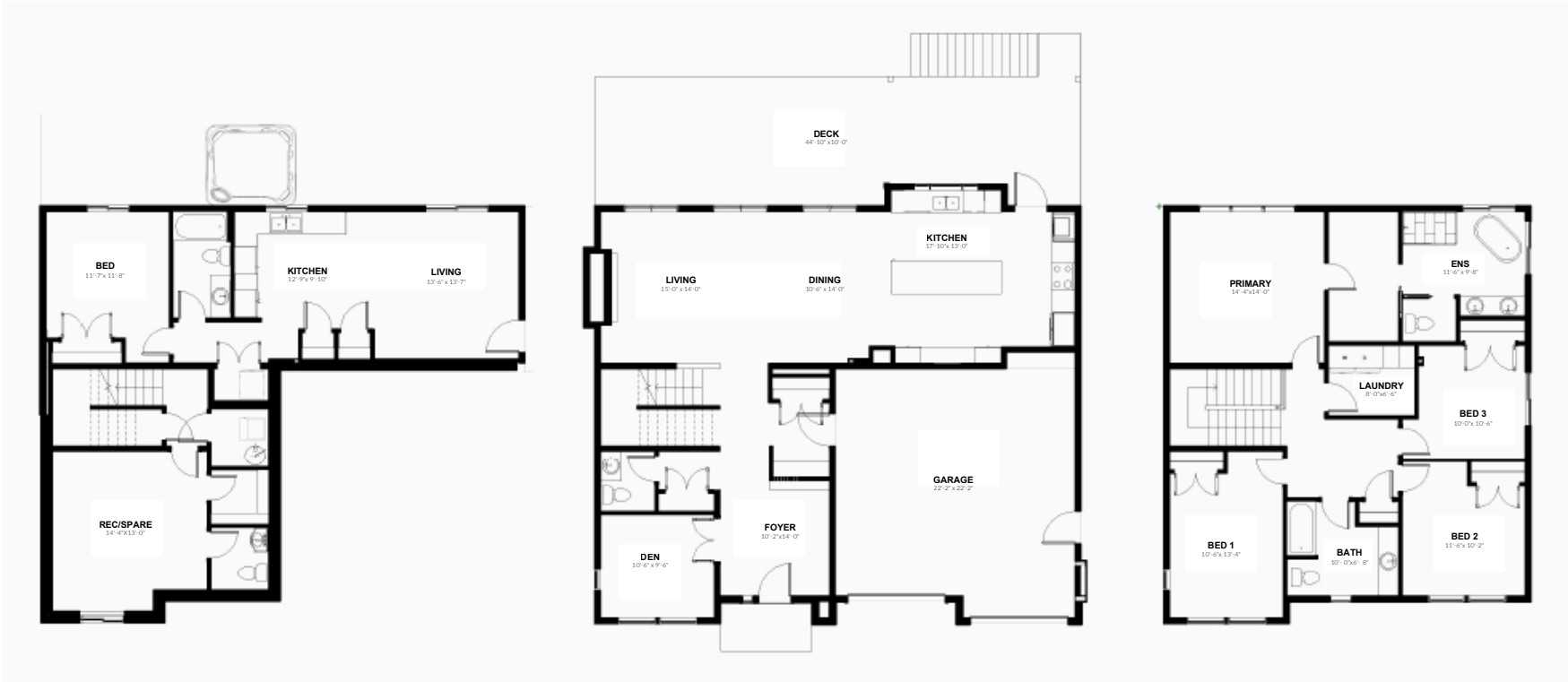
BASEMENT 1,164 sq ft