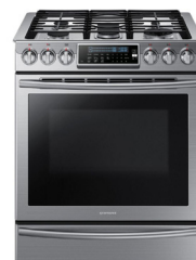
Samsung GAS RANGE