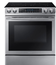
Samsung ELECTRIC RANGE