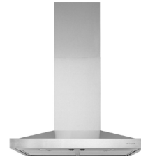
Venmar HOOD FAN