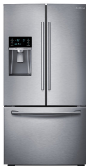
Samsung REFRIGERATOR +water dispenser

Appliance trade-in credit may be available dependent on time of purchase.