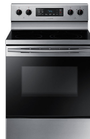
Samsung ELECTRIC RANGE