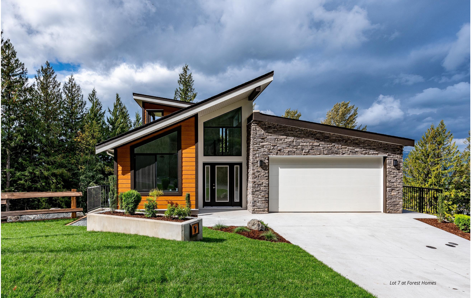
Lot 7 at Forest Homes